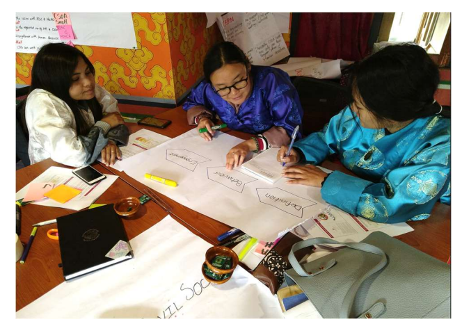
CSO activists draft their advocacy plan in Haa, Bhutan

Since Bhutan's democracy began in 2008, more and more CSOs, cooperatives, youth and women groups have registered with the state. They seek their place in society but face challenges with capacities and understanding their role. The Nyamdrel Project provided grants and strengthened CSO capacities in governance, finance and advocacy while promoting sector engagement and dialogue with the National Parliament through inclusive and transparent advocacy, media work, and lobbying.