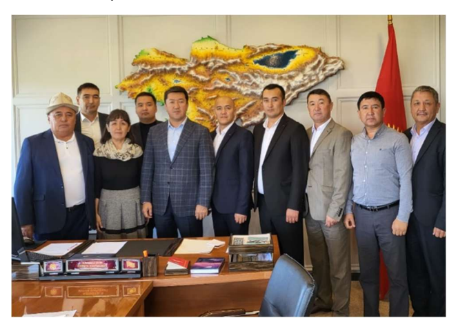
Community representatives meet with national parliamentarians to discuss local irrigation issues

The Irrigation Water Integrity Project in Kyrgyzstan (IWIP) initiated and supported a bottom-up advocacy campaign for improved national legislation on local self-government and irrigation. Local actors lobbied the highest level – and succeeded in creating frame conditions for sustainable irrigation at the local level and improving local governance. Today, IWIP is seen as a model for how INGOs can support grassroots advocacy so that local communities can empower themselves and exert political agency. The Turning Irrigation Reforms into Practice Project (TIRIP) now supports pilot municipalities in the effective implementation of the new law.