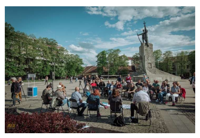
Citizens meeting in Kraljevo, Serbia

Amid the backdrop of a steady decline in democratic governance, For an Active Civil Society (ACT) supports Serbian CSOs in strengthening their institutional capacities as well as their accountability and responsiveness towards citizens; facilitates CSO networks for common issues of concern; and fosters exchange and collaboration between CSOs and local governments with the aim to advance citizen engagement for inclusive and sustainable development.