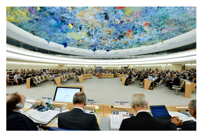
UN Human Rights Council, Geneva

Since 2018, Helvetas has advanced human rightsbased advocacy across its thematic working areas. By advocating through the United Nations Human Rights Mechanisms or the European Human Rights Mechanisms, Helvetas advances specific policy issues in a structured and safe manner. In restricted political contexts, this has proven to be an effective way to convene strategic local partners and strengthen their networks and capacities for advocacy and policy dialogue.