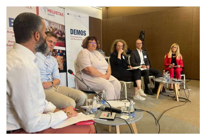
RAN Annual Meeting 2023, Prishtina

This Regional Advocacy Network (RAN) brings together like-minded individuals from diverse sectors, such as the private sector, national and local governments, academia, civil society, educators, and interest groups. Through regular virtual and inperson exchanges, participants discuss successful solutions applied by various Helvetas projects and partners. The network fosters consistent knowledge sharing, allowing participants to learn from best practices and tackle challenges specific to their country and the broader region.