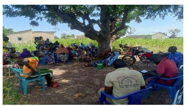
Nambouli village assembly to establish infrastructure management committee, October 2023

The "Wéi" project promotes the stabilization and prevention of violent conflicts in the Atacora region of northern Benin, which is heavily affected by conflicts between farmers and herders, insurgent attacks and tensions around access to natural resources in national parks. It promotes access to and management of green economic and social infrastructure, supports local mechanisms for preventing and resolving conflicts, improves the management of natural resources, and strengthens cross-border cooperation.