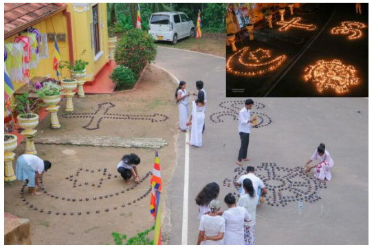
Youth respecting religious diversity by celebrating 'Vesak'

The project promoted reconciliation and social cohesion by involving youth in inter-ethnic, inter-religious, inter-generational and inter-cultural development. Young Sri Lankan women and men from different backgrounds received training and were supported to build relationships across ethnic and religious boundaries and to promote positive social change in their communities. Youth-led cooperatives and social enterprises were initiated to build capacities in mitigating the socio-economic drivers of violent extremism.