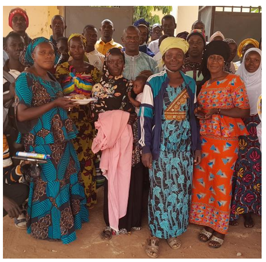
GYPI project staff with key partners in central Mali

Access to land is at the heart of many intergenerational conflicts in Mali. The project "Peacebuilding through access to agricultural land for young women and men in the Sahelian zone of Mali" supported young people to peacefully secure access to land by helping claim their legal rights and strengthen their farming capacity, and by supporting dispute resolution mechanisms.