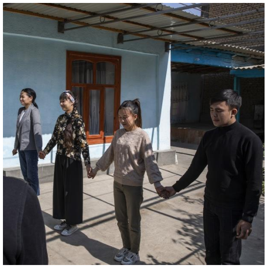
A personal development training for youth in south Kyrgyzstan

The Youth United for the Future project (YOU) helps young people to identify their personal and professional purpose in life and promotes constructive dialogue between young people and adults. By supporting the meaningful participation of young people in family, social and public life, the project contributes to a more cohesive society and reduces the vulnerability of young people to engaging in activities leading to violence.