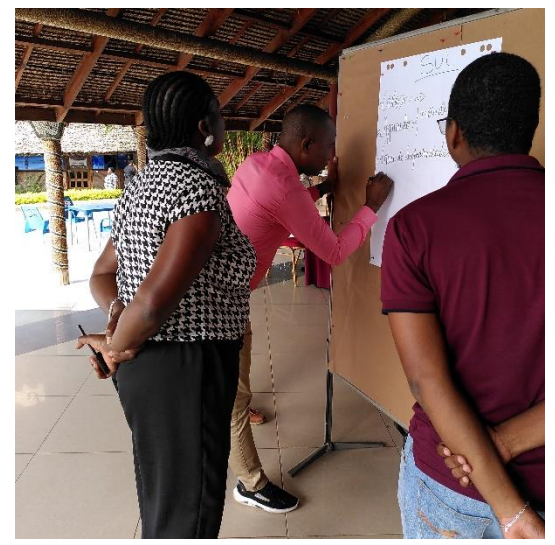
Conflict sensitivity workshop in Nampula, Mozambique

Conflict sensitivity is the awareness that our work, presence, and behavior can have unintended consequences. It means taking action to avoid negative effects and reinforce our positive impact. Conflict sensitivity is integrated into all Helvetas' programs, along with the related topics of gender sensitivity and social inclusion, and we support partners and clients to do the same.