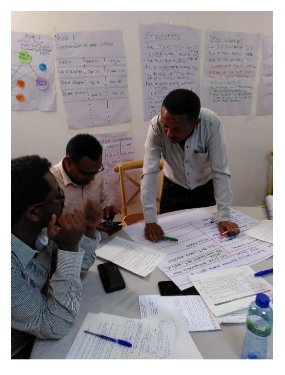
Helvetas staff in a conflict sensitivity and security management workshop, Addis Ababa, Ethiopia, October 2022.

Security management and conflict sensitivity are accorded top priority when operating in contexts with increased exposure to risks and weak capacities to respond to those risks. Our duty of care towards staff, partners and primary stakeholders makes safety and security risk management of fundamental importance, and explicit discussions about risk and red lines are conducted with staff and partners. By integrating conflict sensitivity, we not only aim to avoid doing harm, but also to have a deescalating impact on conflict dynamics where possible. This increases our acceptance and improves our collaboration with local actors. Moreover, conflict management competence and mediative communication skills and attitudes, increase the safety and security of our staff and programmes.