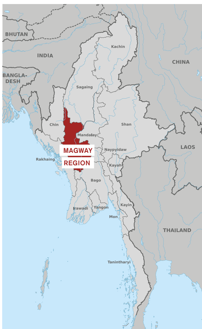
Figure 1: Map of Myanmar

The change of power in February 2021 led to the replacement of all major positions in regional and national governments, which also has consequences on the implementation of the S4E project. Achievements on policy level, such as the cooperation with the Regional Skills Development Association (RSDA), are most affected. This institution accredits developed curricula and certifies trainees, who pass the skills test. Due to the current political situation, the project is not able to continue strengthening the local governance system and policy dialogue. Instead, the S4E project is focusing its efforts on supporting the local private sector and adapt approaches accordingly. Since the S4E project works closely with the private sector and is with its company training approach not much dependent on public TVET schools, most activities can continue with minor adaptations.