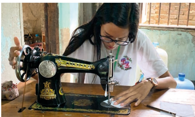
Female fashion tailoring